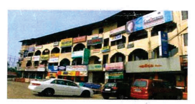
Pulickal Trade Centre Nagampadom, Kottayam