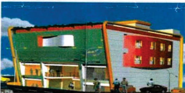
Makkil Centre Good Shepherd Road, Kottayam