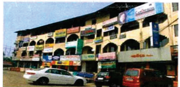
Pulickal Trade Centre Nagampadom, Kottayam